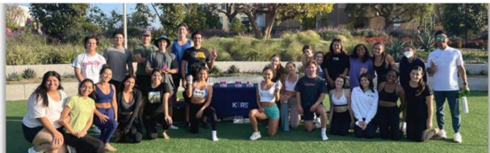
MEMBERS OF K.O.R.E.