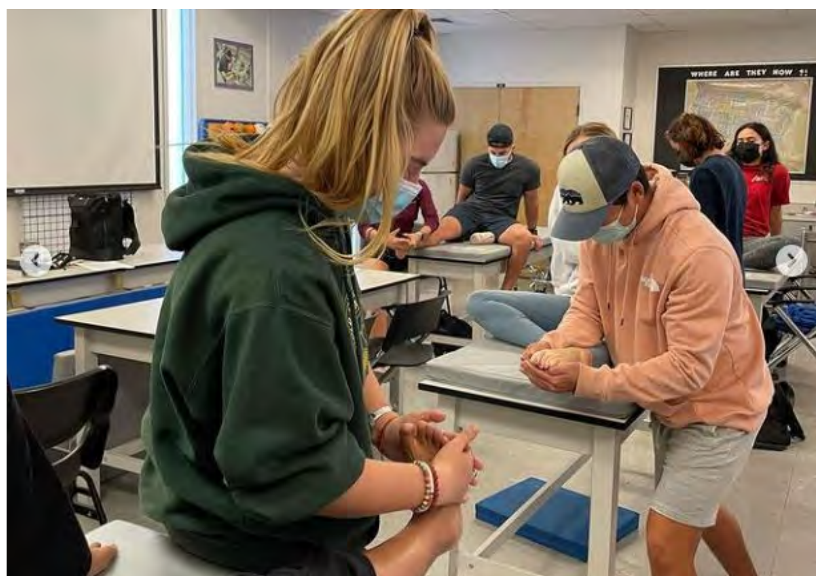
SDSU ATHLETIC TRAINING PROGRAM STUDENTS IN THE ATHLETIC TRAINING PROGRAM LAB