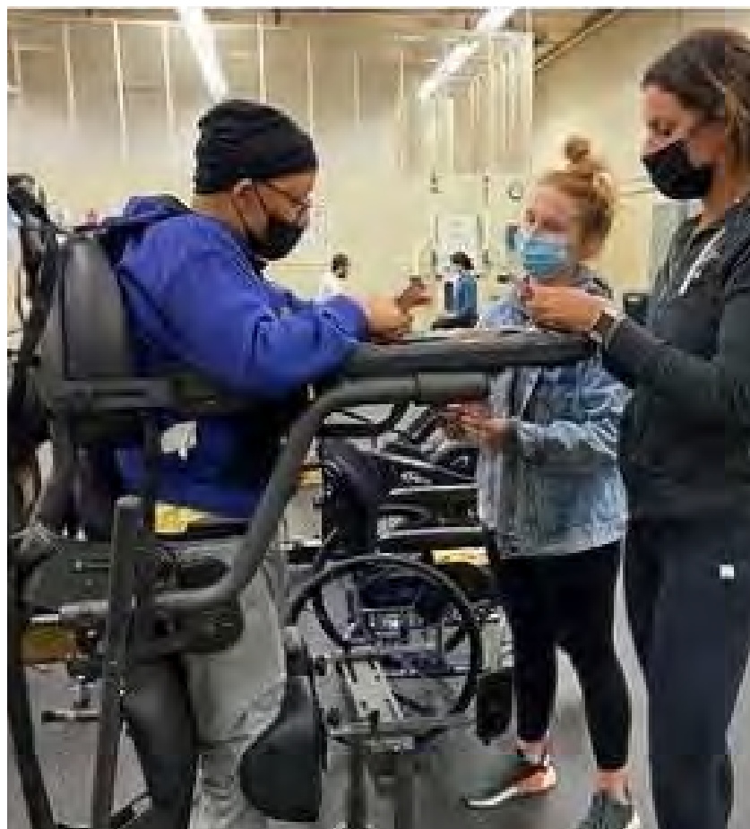
SDSU ADAPTIVE FITNESS CLINIC STUDENTS ASSISTING A PATIENT