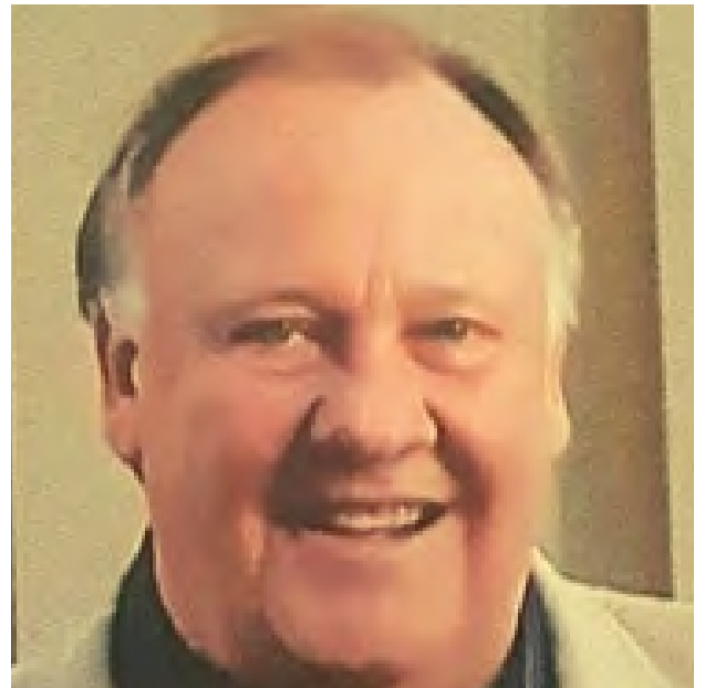
ENS EMERITUS FACULTY MEMBER