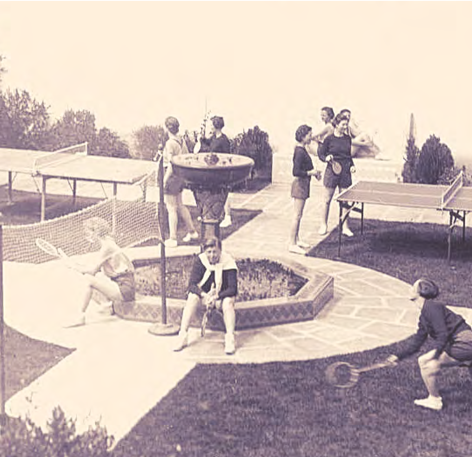
STUDENTS PLAYING BADMINTON AND TABLE TENNIS IN THE COURTYARD OF THE WOMEN'S GYMNASIUM IN ENS, 1935